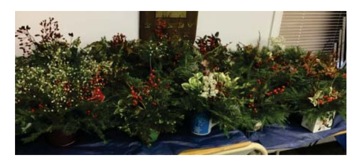
We closed the year with a well attended delicious

As the year came to a close, members gathered for a fun afternoon to make table floral arrangements for our Christmas Dinner tables and to make Swags for our front doors. We also got to enjoy beverages and sweets afterwards.